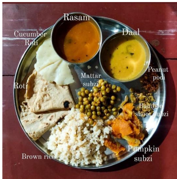
One of our colourful dinners at Timbuktu Collective